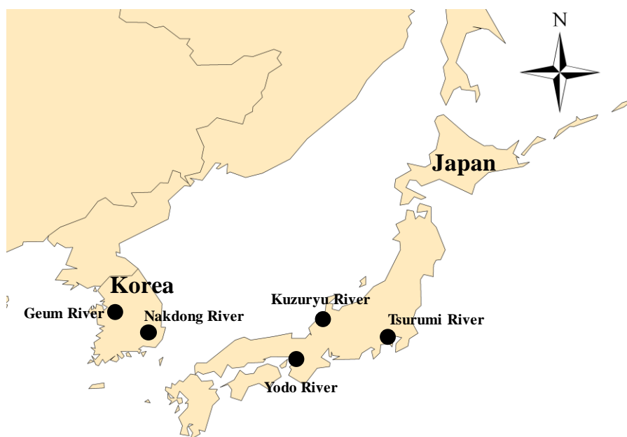
Fig. 1 Sampling locations

Sampling. Fig. 1 shows the sampling location in this study. Surface sediments were sampled using a grab sampler (Ekman-Birge type bottom sampler) at 27 sites from 3 rivers of Japan (Kuzuryu River (K1~K7), Yodo River (Y1~Y6), and Tsurumi River (T1~T4), n=16) and 2 rivers of Korea (Geum River (G1~G5), and Nakdong River (N1~N6), n=11). Sampling dates were May (Korea), and December (Japan), 2011, respectively. Sediment