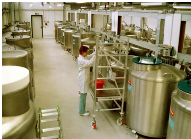
Fig.1 Archive for environmental samples

The filling of the containers is regulated by an automatic system which keeps the liquid nitrogen level between a minimum and maximum level. The maximum temperature in the cryostorage containers is -150°C. These low temperatures ensure that chemical processes in the samples are minimized. Atmospheric oxygen is excluded through the inert gas layer resulting from the evaporation of liquid nitrogen so that oxidative reactions are prevented. Since the temperature is below the glass transition temperature of water of approx. -135°C physical processes are stopped (e.g., no growth of ice crystals which may change the morphology of the sample material). The cryogenic storage conditions should ensure that no changes in the state of the sample material occur over a period of several decades.