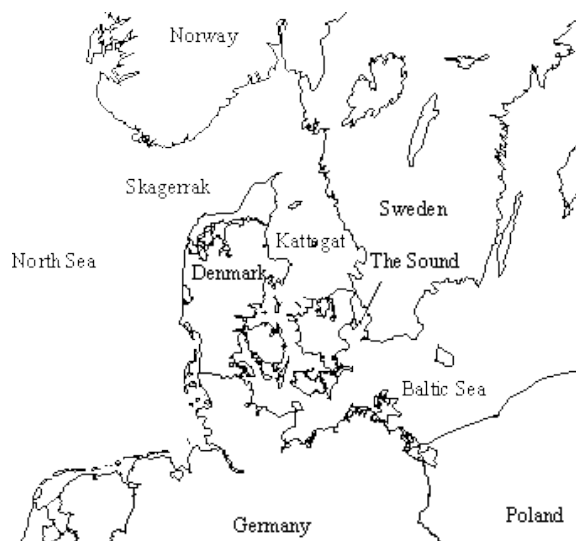
Figure 1. Waters around Denmark.

The Danish monitoring programme for contaminants in food include investigations of persistent organochlorine contaminants such as PCB (polychlorinated biphenyls) and compounds that have earlier been widely used as pesticides (for example DDT). 1 Because of their stability and tendency to accumulate in fatty tissues they can enter the food chain and therefore be found in marine species. Relatively high levels occur in cod liver, which has high lipid content and for that reason is suitable for monitoring purposes.