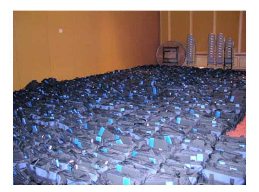
Photo Above : 1,000 delegate bags packed and ready to go. All the stuffing was completed on Sunday in time for the opening reception.

Lastly, the conference also represented a partnership with our program sponsors – many of whom populated the exhibit areas located on the 3<sup>rd</sup> and 4<sup>th</sup> floors of the Westin Copley Conference Center. The financial support from a record number of exhibitors and sponsors (25% of all revenues) was unprecedented. The Dioxin 2003 program would not have been possible without their support. This level of commercial support now serves as a model for sponsorship in future years.