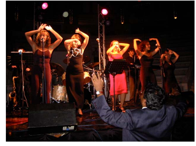
A moment to finally relax after a chaotic week!