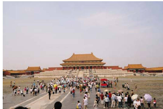
Forbidden City

After the impressive tour to these attractions, the organizers provided another good opportunity for participants to enjoy the uniqueness of Chinese culture and art. During the Banquet Thursday evening, traditional Chinese opera and Chinese Classic Music performances were presented. It was then time to cheer for the success of this meeting, say good-bye to all participants and wish them a safe trip home.