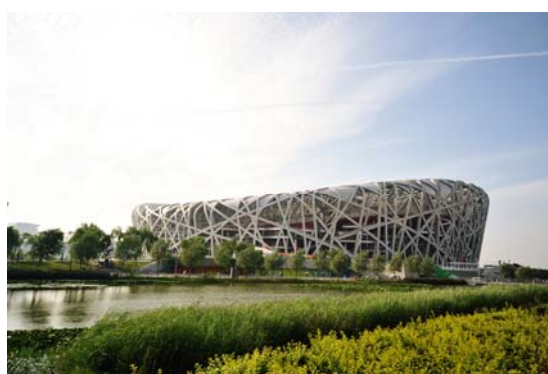
Beijing International Convention Center (BICC) and the “Bird Nest” nearby –Y. Kunimi

During the 25 th Symposium-Dioxin 2005 in Toronto, the 29 th Symposium-Dioxin was awarded to Beijing. A local organizing committee was founded one year later. The symposium was hosted by the Research center for Eco-Environmental Sciences, Chinese