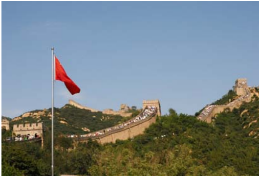
Great Wall - T. Nakano

historical significance. The Forbidden City, lying at the center of Beijing, was the imperial palace for twenty-four emperors during the Ming and Qing dynasties. There were 471 delegates went to the Great Wall and 125 delegates went to the Forbidden City. The inclusion of a social program provided a good opportunity to make friends and for meeting attendees to understand and enjoy the local history, culture and custom. A series of special activities were thoughtfully arranged and well organized during the meeting.