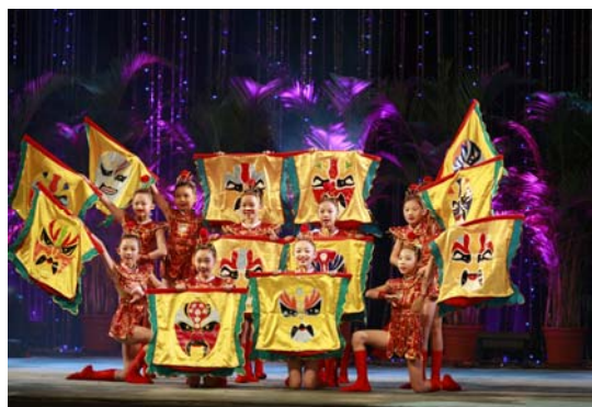
Chinese Dolls -- Zhang Sanfeng

During the five day meeting, a total of six plenary talks, 256 oral presentations and 432 posters were presented. Each day began with a plenary lecture followed by oral presentations held in 5 concurrent sessions covering 48 different topics. The poster presentation was arranged in two sessions held on Monday and Tuesday. This meeting also provided a great opportunity for participants from not only the developed but also developing countries to share their experiences, problems encountered and outcomes in the implementation of Stockholm Convention, making environmental policy and management a topic of special emphasis in this symposium.