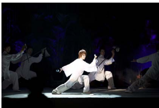
Tai Chi Dance -- Zhang Sanfeng