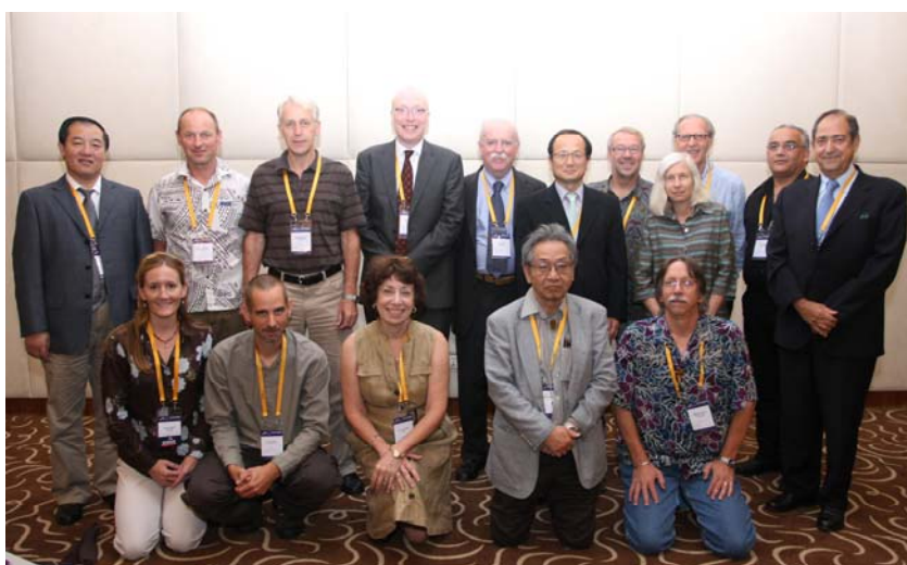
Members of International Advisory Board