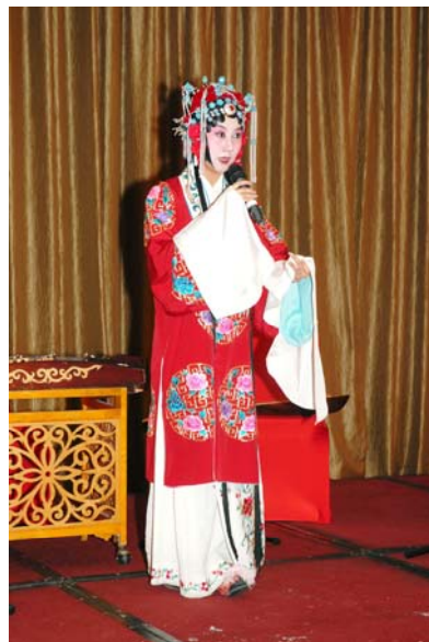
Beijing opera, from banquet

After the impressive tour to these attractions, the organizers provided another good opportunity for participants to enjoy the uniqueness of Chinese culture and art. During the Banquet Thursday evening, traditional Chinese opera and Chinese Classic Music performances were presented. It was then time to cheer for the success of this meeting, say good-bye to all participants and wish them a safe trip home.